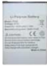
Battery 5100 mA AT-CART5502