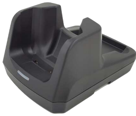
Desktop dock AT-CART5501