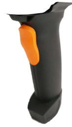
Pistol grip AT-CART5504