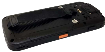
Hand strap AT-CART5503