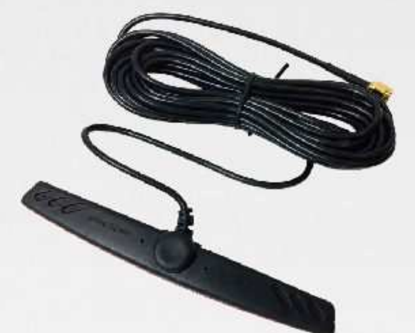
WIFI / BT Antenna