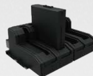
4-bay Battery Charger