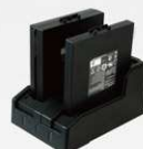
2-bay Battery Charger