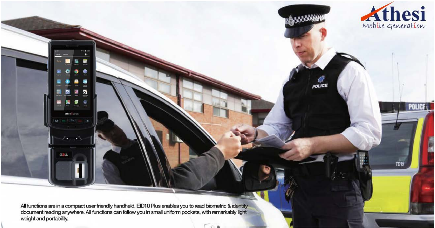
All functions are in a compact user friendly handheld. EID10 Plus enables you to read biometric & identity document reading anywhere. All functions can follow you in small uniform pockets, with remarkably light weight and portability.