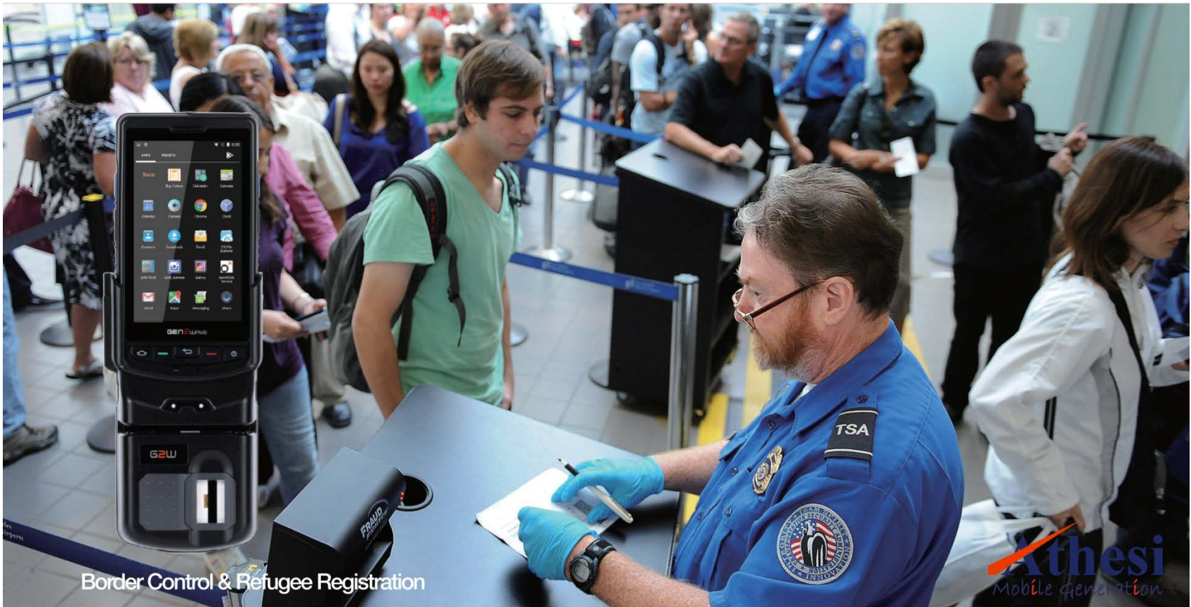
Border Control & Refugee Registration