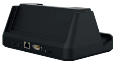
Desktop Dock AT-CAE1201K