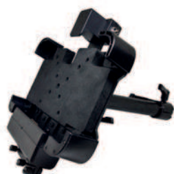
vehicle dock AT-CAE1011B1