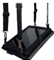
Harness Carrying Case AT-CAE1013