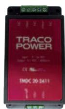
DC Converter AT-CAE1005