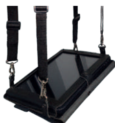
Harness Carrying Case AT-CAE1013