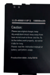
additional removable Battery 10000 mA 3,7V AT-CAE1008