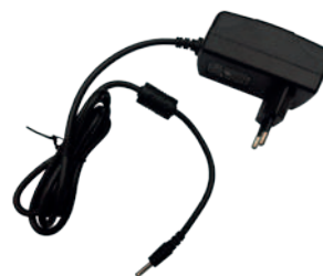
Batterie 5000mA n3.7V AT-CAE805