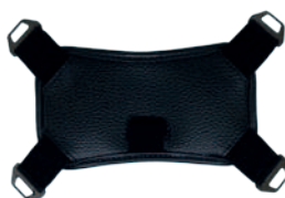
Hand strap AT-CAE1006