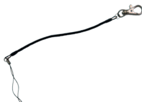
Stylus attachment AT-CAE806