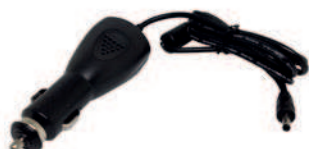
Cigar cable charger AT-CASPA4308