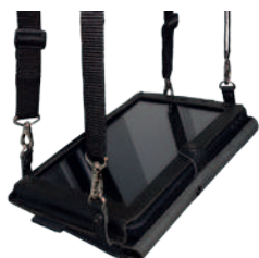
Harness Carrying Case AT-CAE1013