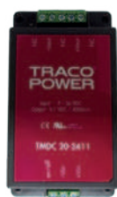
DC Converter AT-CAE1005