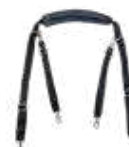
Harness strap AT-CAE1207B