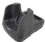
Destock dock AT-CART5501

Removable battery, very rugged, integrated hand strap, Full HD display, USB-C.