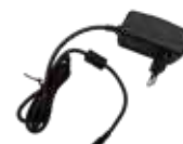
Power adapter 5V AT-CAE805