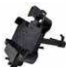
E10B Vehicle dock with key lock, Ethernet, DC jack, 2 USB, RS232 DB9, kit fixation AT-CAE1011B AT-CAE1011B1