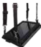
Harness carrying case AT-CAE8010