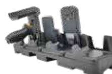
4 slots desktop dock