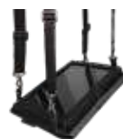
Harness carrying case AT-CAE1013