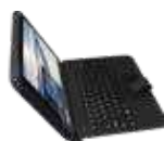
Removable QWERTY keyboard AT-CAE1210