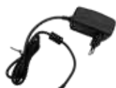
Power adapter AT-CAE805 AT-CAE1202