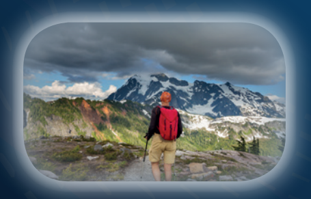
Everywhere for Everyone